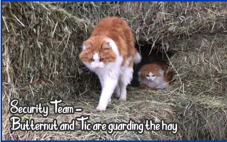
Security Team - Butternut and Tic are guarding the hay