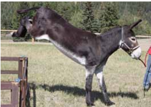
“The Star of Our Agility Program”

“From Total Withdrawal and Self-Abusive Behaviours to Social Butterfly”