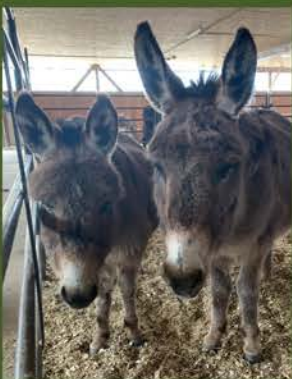
Taco & Bella