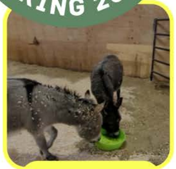
Teddy & Little José

José and his friend Teddy came to the Refuge after their previous caretaker passed away. Due to José's attitude he was difficult to place in a new home.