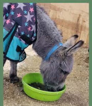
Senior Mini Donatello enjoys his warm mash.