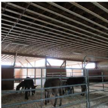
Strapping goes up in the Mammoth Barn

Over the past few years we have been working on upgrades to all the barns. The Senior Barn is completely insulated walls and ceiling; over this past winter we have completed insulating the ceilings of the rest of the Barn. We will be continuing to insulate all other sections of the Barn as time and budget allows. The cozy atmosphere from the lower ceilings and the insulated dormer doors has made a huge difference this year to the Donkey's health - we have had fewer cases of colic in all our Herds as the weather fluctuates. We are so grateful for all our wonderful supporters who have helped us improve the barns for our Donkeys & Mules.