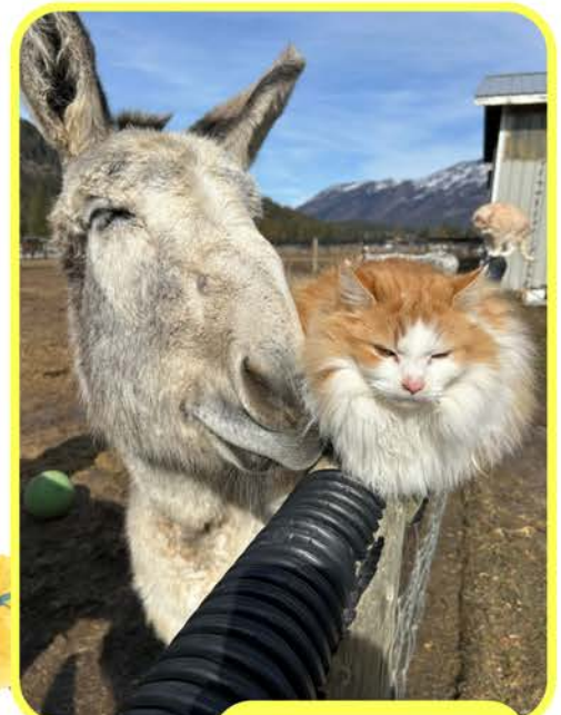
Guinness & Butternut