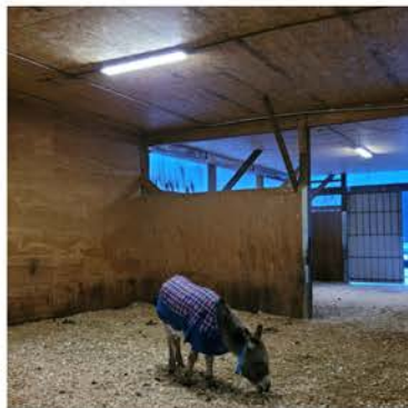
Ceilings cladding goes up in all the Barns