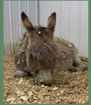
Senior Donkey Daisy enjoyed this winter in her super-fluffy coat.

Senior Donkey Rooster is the oldest long-ear resident at the Refuge. He is turning 50 this year! Rooster really benefits from the warm & cozy senior barn. We still keep a coat on him during cold weather to make sure he doesn't catch a chill. Rooster has a very distinct bray - you might hear it when you visit. We would love you to join us on May 25th to celebrate Rooster's 50th Birthday!