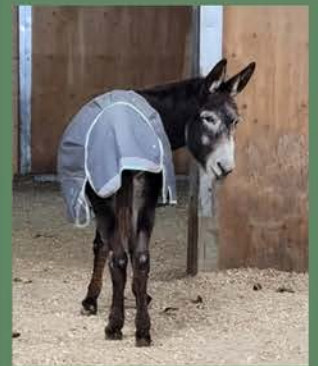
Senior Donkey George, who suffers from Cushings, was thrilled to have the barn warmer!